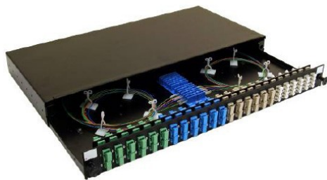
IFRMPP24SCD Fiber Patch Panel with 24 Port SC Duplex