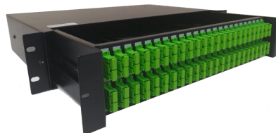
IFRMPP48SCD Fiber Patch Panel, 48 Ports SC Duplex