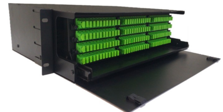
IFRMPP144SCS Fiber Patch Panel, 144 Ports SC Simplex