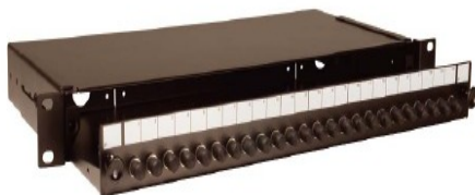
IFRMPP24STS Fiber Patch Panel with 24 Ports ST/FC