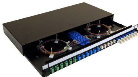
IFRMPP24SCS Fiber Patch Panel with 24 Ports SC Simplex