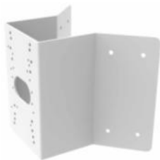
Corner Bracket IBCRWM