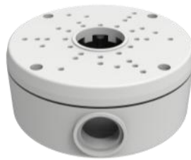
Junction Box IBBWM-134