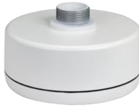
Junction Box IBBCM-134