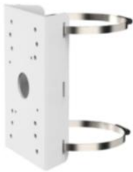
Pole Bracket IBBCPM