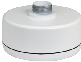
Junction Box IBBBCM-134