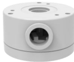
Junction Box IBBWM-100