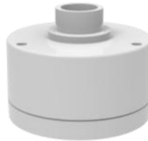
Junction Box IBBBCM-100